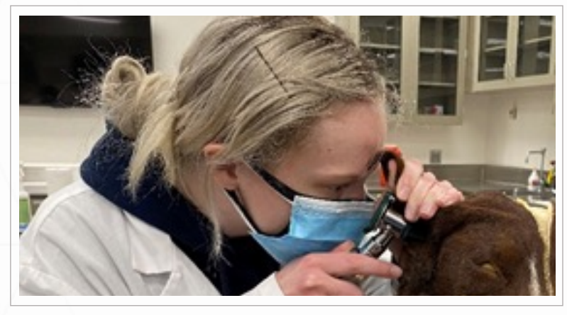
A veterinary exam being performed using the developed training model.

Fawzy Elnady and his colleague, Heng Tham, have developed an otoscopy training model that can be used to demonstrate the natural external and internal anatomical appearance of the external ear. Developed using an ethically sourced head preserved using the Elnady technique, the model features moveable ears and an ear canal that can be straightened to view its interior. Due to the fact that it is produced by preserving a natural specimen, the model provides natural variations and imperfections absent from fully artificial products. The model is also clean, dry, durable, flexible, safe, and odor free. This new training model has obvious benefits in the veterinary training field since it can also serve as a training tool for dental, eye, and ear nerve blocks.