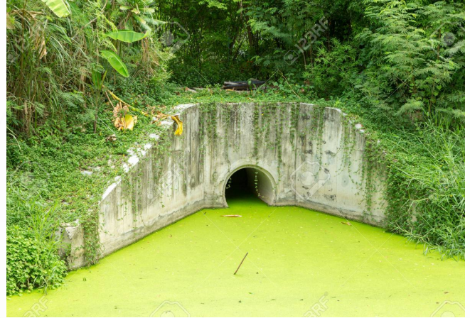
Algal blooms caused by enrichment of Phosphorus in aquatic environments.

Our team found that overexpression of a unique gene in plants causes the leaves to hyperaccumulate inorganic phosphate along with other metals. The impact of our invention is two-fold. First, our proposed invention will uniquely express this gene in a variety of plant species to reclaim Phosphorus from polluted environments. Additionally, we will process the plant material into a form which can be redistributed to agricultural areas as a slow-releasing fertilizer. Our invention and strategy will enhance Phosphorus-use efficiency by reclaiming Phosphorus from polluted environments and redistributing to nutrient-poor areas.