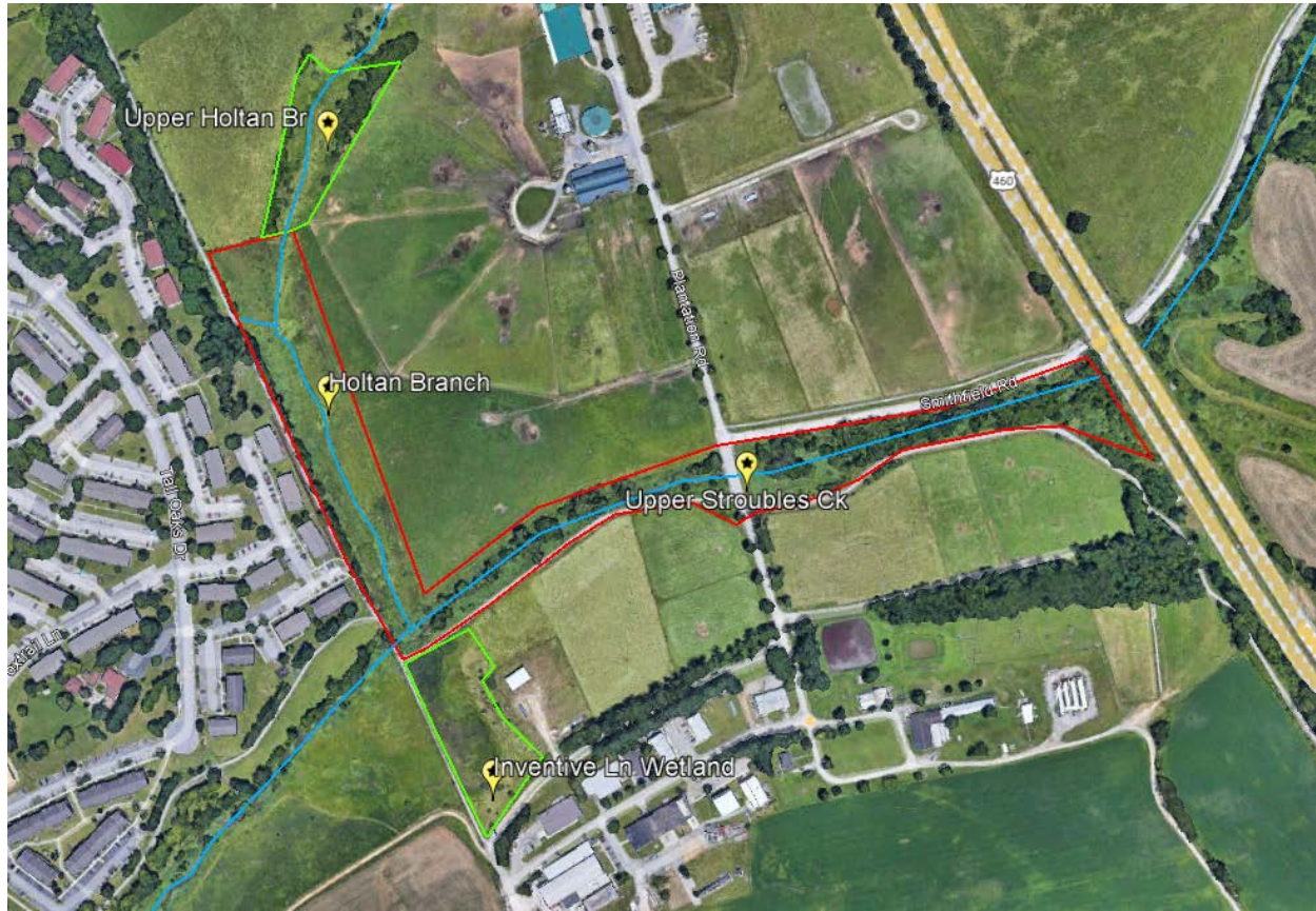
Image 2: Primary target sites for Spring 2023 (Green RFP 2021 implementation). The red areas will receive follow-up plantings to achieve the desired 435 trees/acre target and the green sites will receive initial native vegetation restoration work. The Inventive Lane Wetland Site will move forward in conjunction with VTSID, BSE, Jamie King (VT arborist), and CALS.