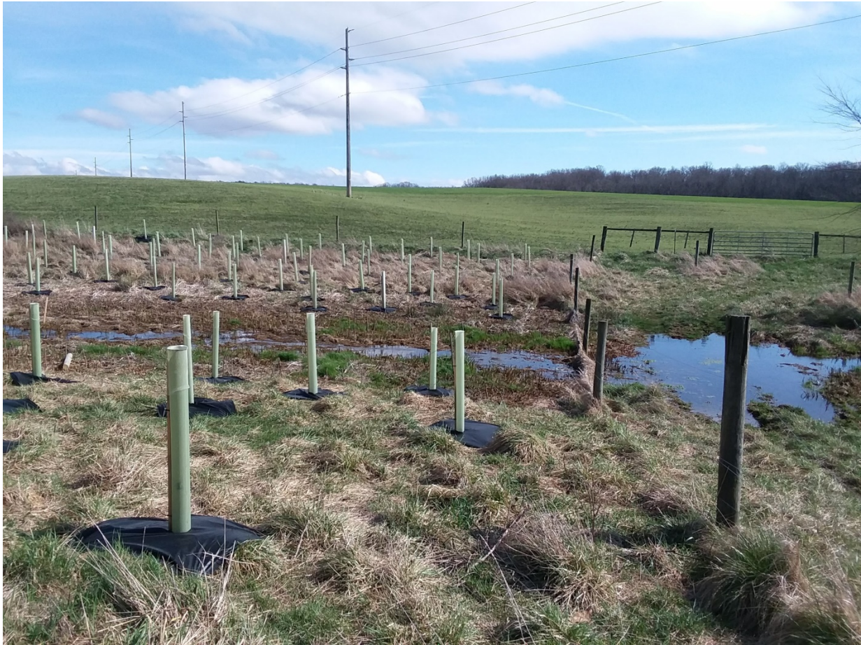
Image 14: Docs Branch planting in February 2020 that was paid for with Green RFP funds.