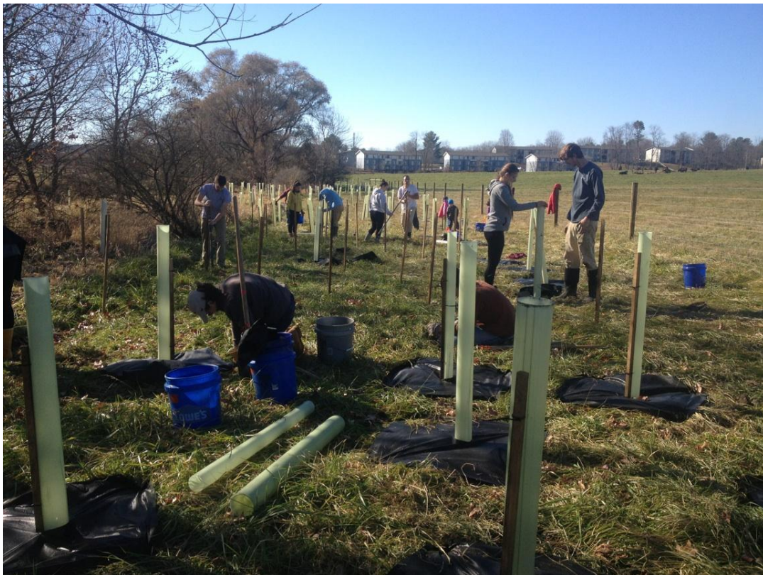
Image 11: Green RFP Funded SCC tree planting event on Stroubles Creek - December 2017