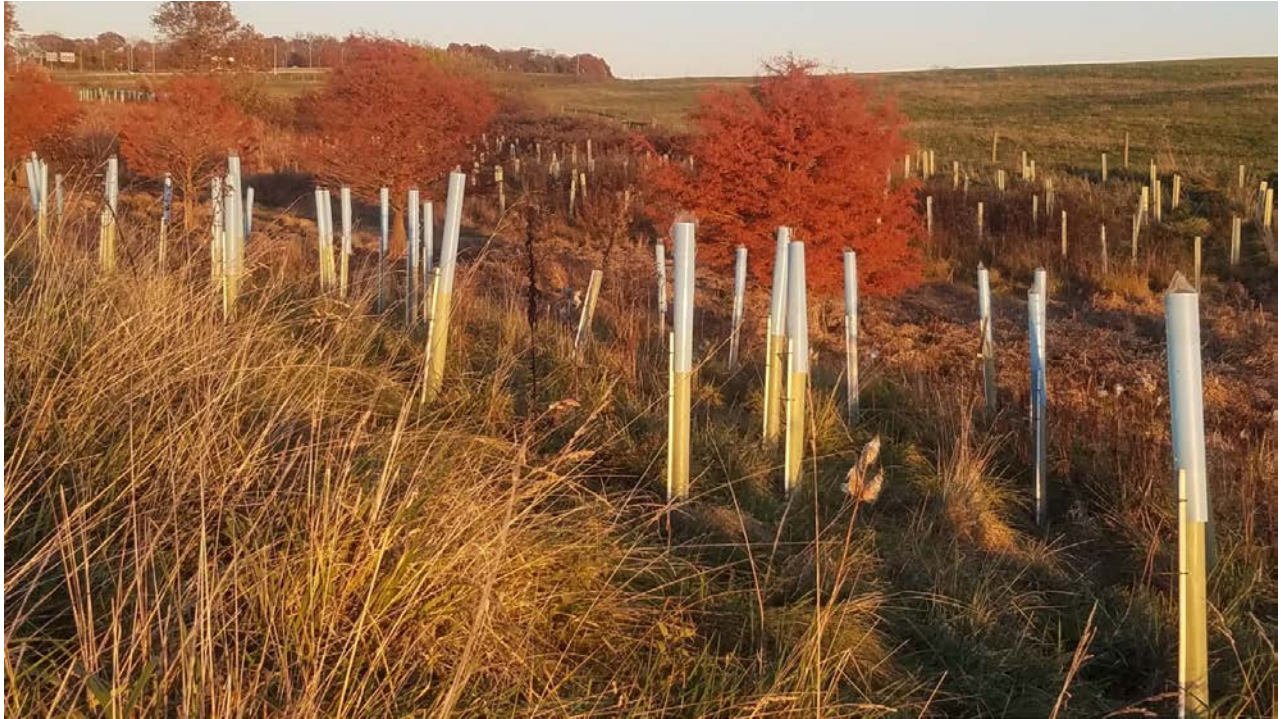
Image 7: Tree shelter extensions installed by SCC and Inmotion Blacksburg in November 2019 (blue sections of tube). These trees were planted with Green RFP funds in 2020 but the 4 foot shelter heights chosen for that planting resulted in heavy deer browse. The tube extensions will ensure the investment made that year will be successful and the trees will survive.