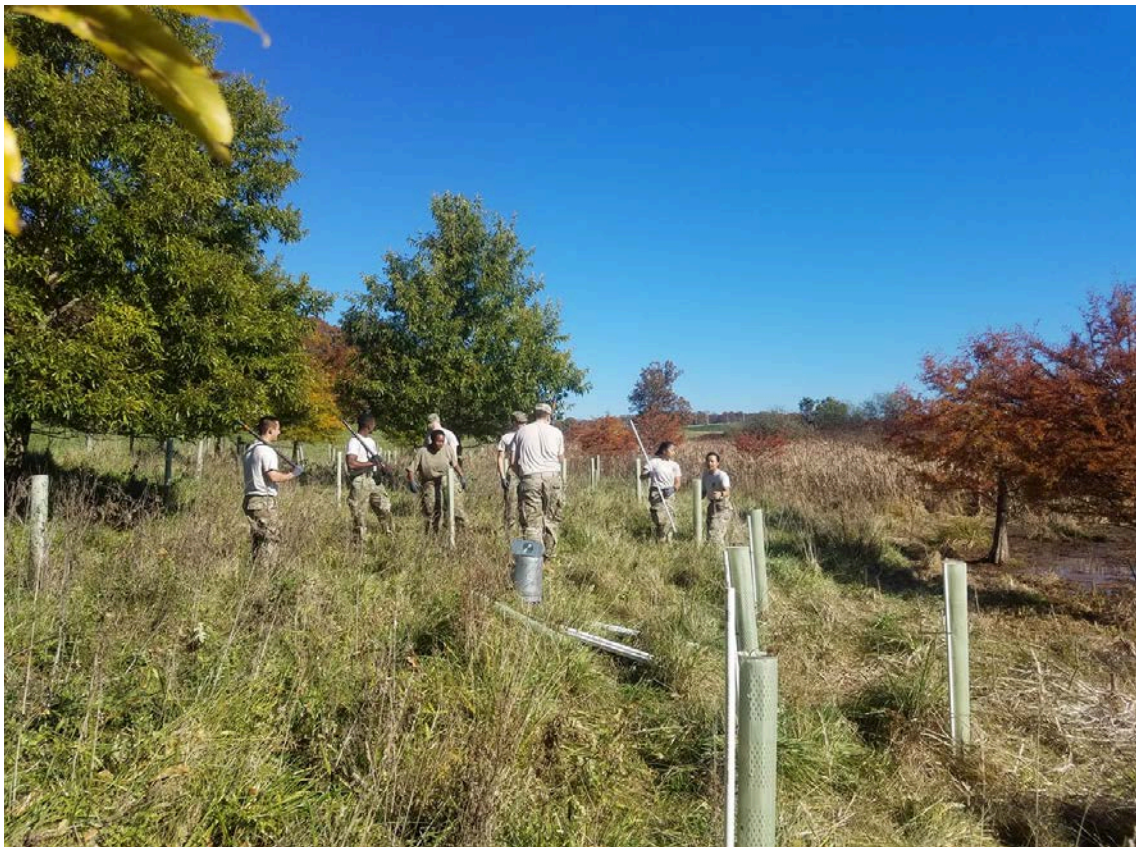
Image 6: VTCC helping on Docs Branch maintenance efforts. The VTCC covered all the areas of historic Green RFP projects associated with this project in November 2021.