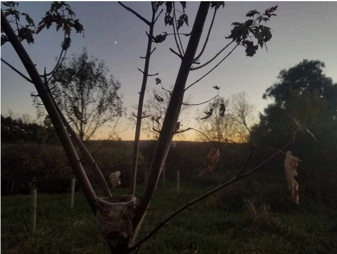
Image 10: Hummingbird nest on a maple tree that was planted with Green RFP funds in December 2017