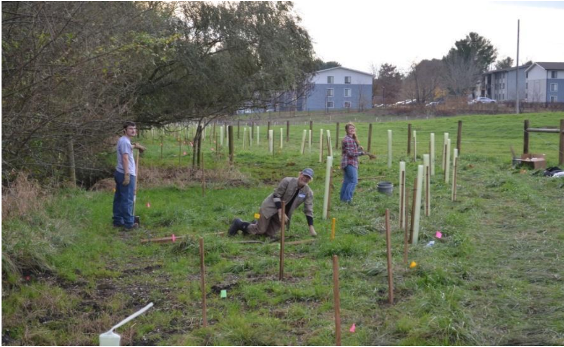
Image 8: SCC volunteers planting seedling trees. The fence in the background is the new livestock exclusion fencing to keep livestock away from Stroubles Creek. This project was through the Green RFP grant.