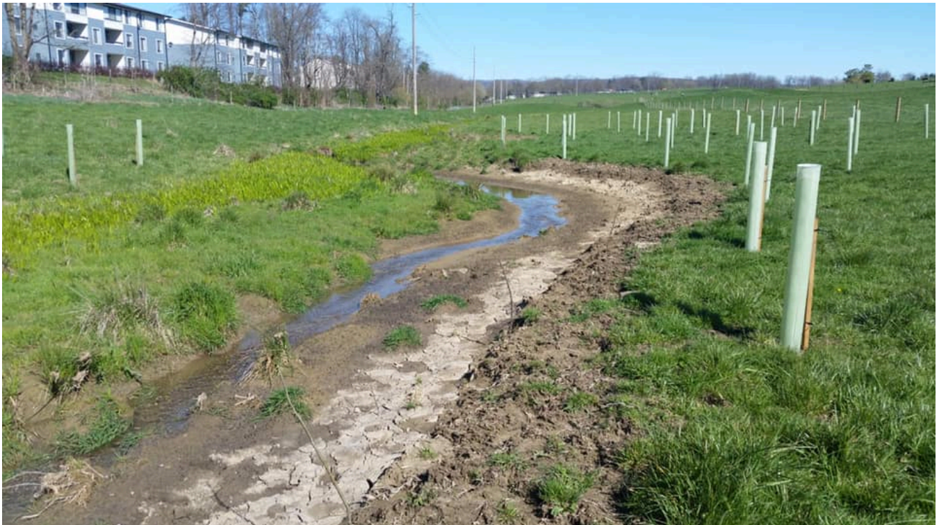
Image 15: Holtan Branch in March 2016 during the construction of livestock exclusion fencing and native tree planting.