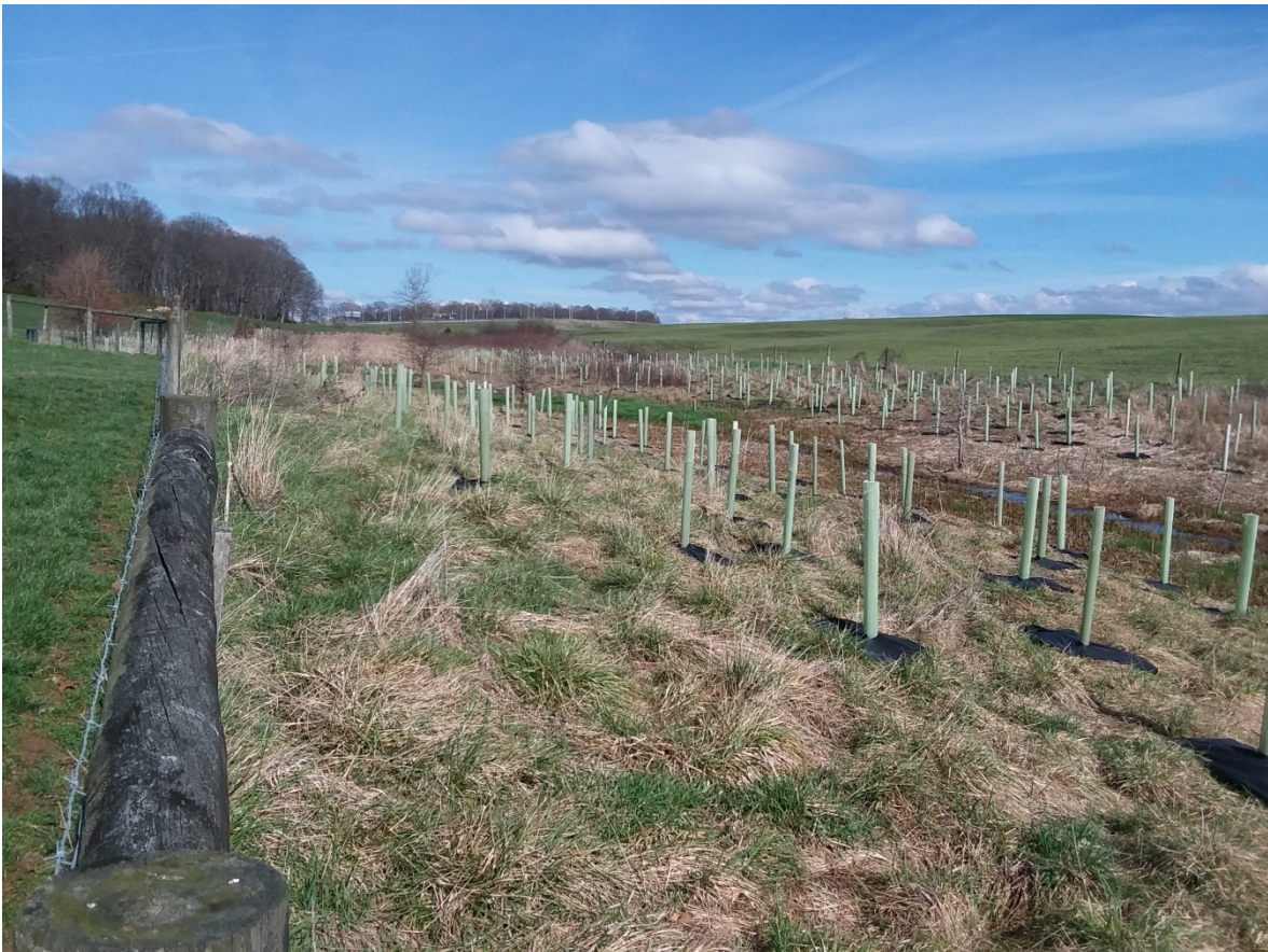
Image 13: Docs Branch planting in February 2020 that paid for with Green RFP funds.