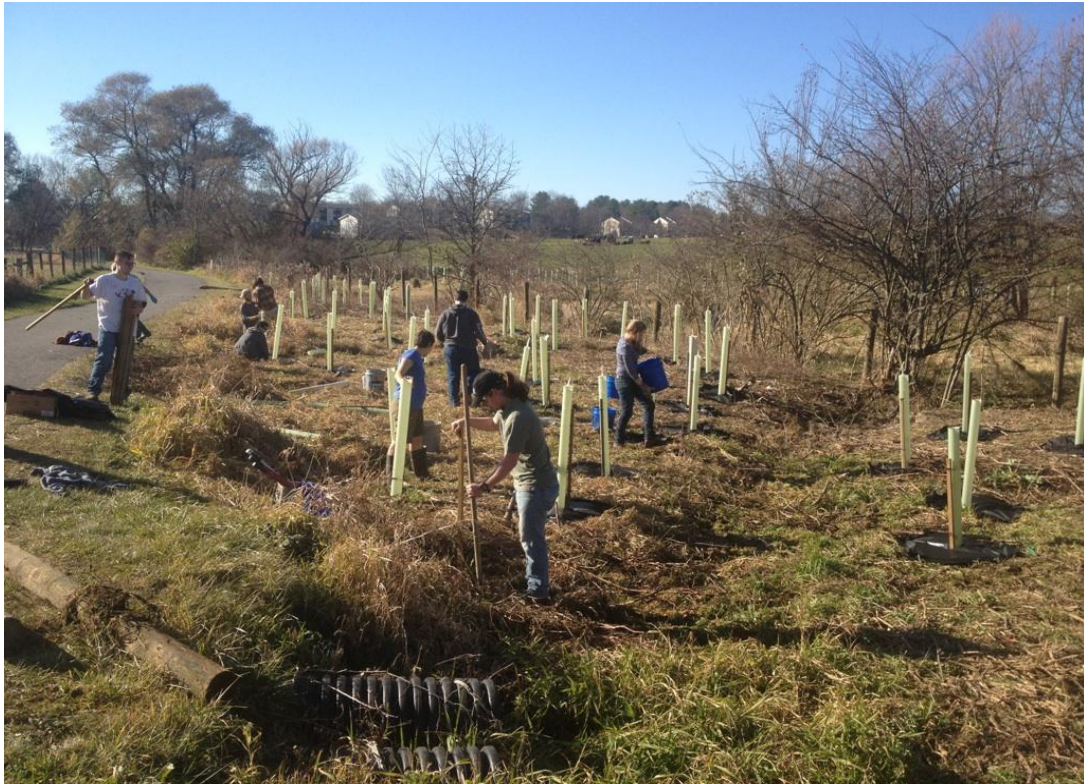
Image 12: Restoring riparian habitats with Green RFP funding - December 2017.