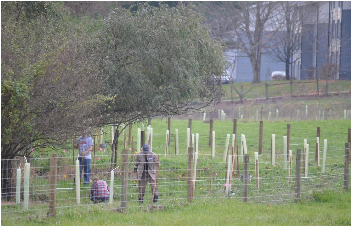
Image 9: Volunteer planting bare root seedlings between the new fence and Stroubles Creek funded by the Green 2016 RFP grant – Dec 2017.