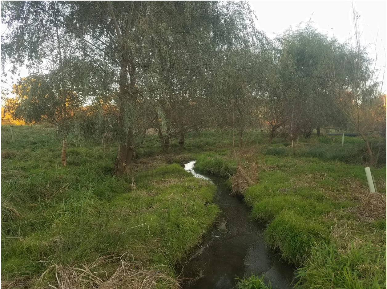
Image 16: Holtan Branch in November 2021 in the same location as Image 15 above, looking downstream.