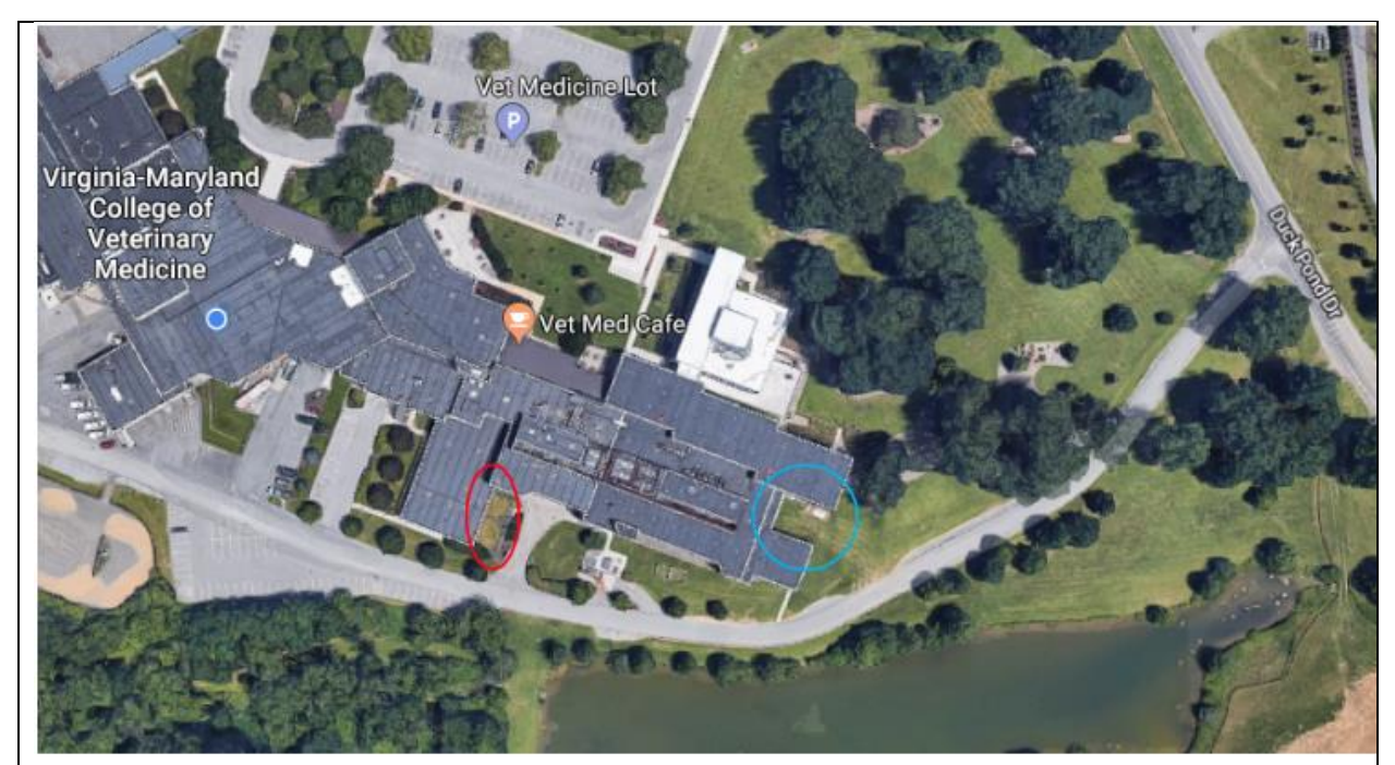
Figure 1. This aerial image shows the current location of the outdoor run (circled in red) and the proposed new location (circled in blue). This alcove is not currently used for any purpose and would make the ideal location for the new outdoor run because it is relatively flat and the building walls can be integrated into the structure, which minimizes the amount of fencing required.