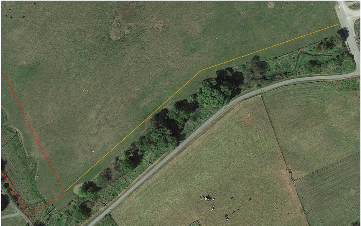
Figure 1: Overview of the restoration project site on Stroubles Creek near the VT Beef Center. The yellow line depicts the location of the proposed livestock fencing.