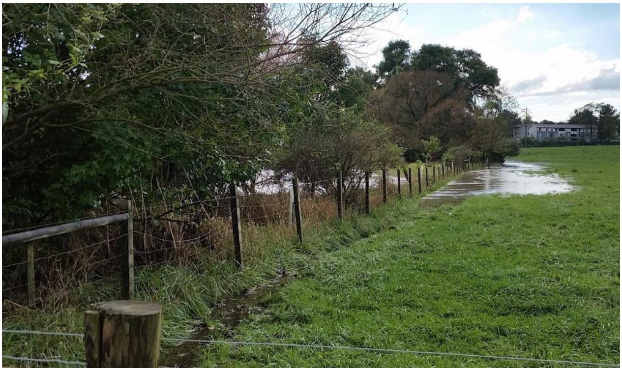
Figure 2: Water from Stroubles Creek overflowing its banks into the pasture following a storm event. The proposed fence would be installed 25-30 feet further away from the existing fence shown in the picture and beyond the extent of flood stage water levels.