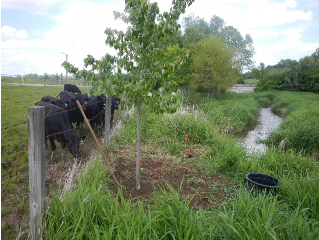
Figure 3 – Cattle congregating nearby a recently planted red maple, planted by the Stroubles Creek Restoration Initiative. Where the cattle are standing in this picture is within the boundaries of the extent of the water in figure 2. Several other areas along this 980' reach of fencing are currently eroding into the stream from streambank erosion at stream bends. This is giving cattle access to the stream in those areas.