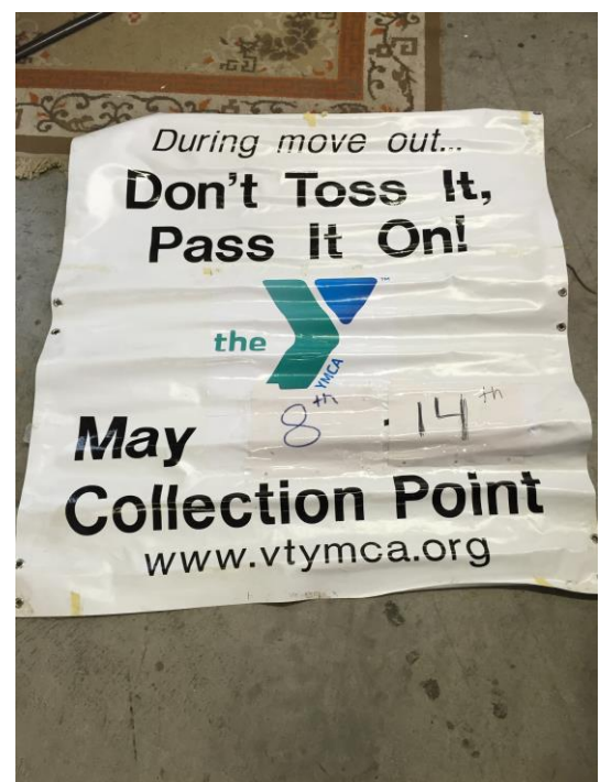
Figure A: Current Banners